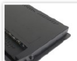
Aluminum Bezel and Housing