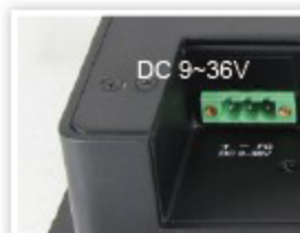
Isolated DC 9~36V Wide Range Power Input

▶▶ For more information of APC-3X20 series, please visit at: www.aplextec.com or contact us at: sales@aplex.com.tw