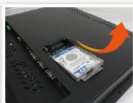
Easily accessible storage design