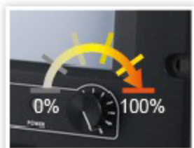
Brightness control from 0% to 100% by dimming knob